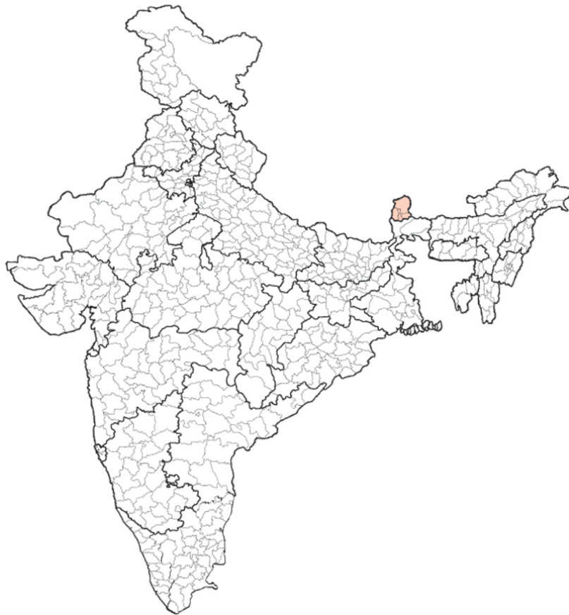
FIGURE 5(E): Map of India highlighting Sikkim State